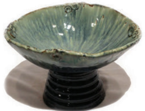
EXTRA-LARGE PEDESTAL BOWL EPB8 | $275