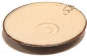
6" THROWN SIDE PLATE