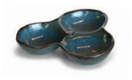
3 WELL TRAY