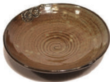
MANSHIP THROW BOWL MS3 | $50

Companion pieces. Approx: 5.5" x 3". Shown in Vanilla Bean.