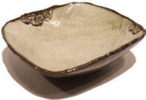
EXTRA-LARGE SQUARE BOWL

Approx: 3" x 12" x 12". Shown in Peacock.