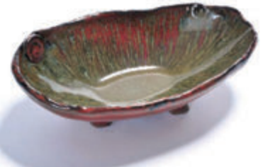
FOOTED OVAL SERVING DISH ROSD | $64

Approx: 3" x 11" x 7". Shown in Peacock.