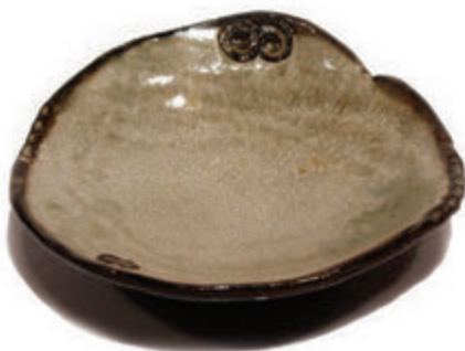
ENTREE BOWL EBF4 | $60