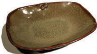
SMALL RECTANGLE BOWL ERB1 | $115

Approx: 3" x 11" x 7". Shown in Peacock.