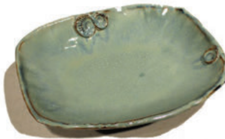
MEDIUM RECTANGLE BOWL ERB2 | $130