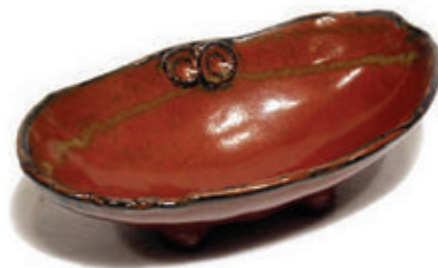
OVAL PORRIDGE BOWL EBO2 | $50