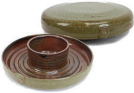
REVERSIBLE CAKE PLATE MMCP | $110

Use as a cake plate or chip & dip. Approx: 3" x 10". Shown in Hazel.