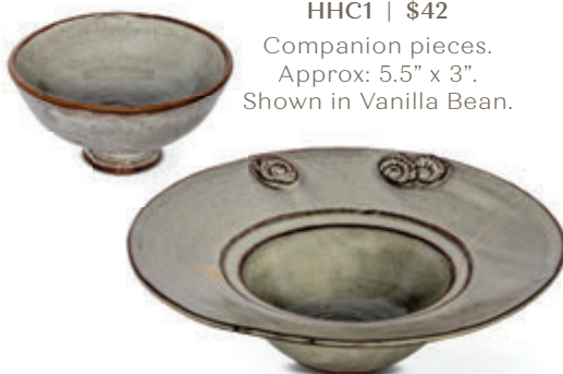
WIDE-RIM SOUP BOWL EWR5 | $60

Used by Hot & Hot Fish Club. Approx: 3" x 10". Shown in Vanilla Bean.