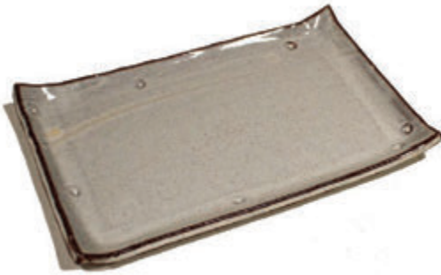
6X11 SHARE PLATE