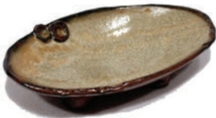
OVAL FOOTED SIDE DISH ESD1 | $38

Approx: 1" x 8" x 4". Shown in Sapphire.