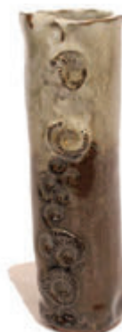
MEDIUM FREEFORM VASE