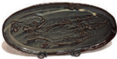
FISH PLATTER EFISH3 | $185

Use it as a platter, serving dish or a dinner plate. Approx: 1" x 13.5" x 8". Shown in Peacock.