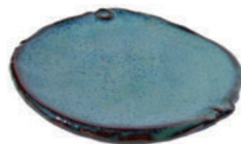
ROUND FOOTLESS SALAD APP

Freeform round and un-footed. Approx: 1" x 10". Shown in Sage.