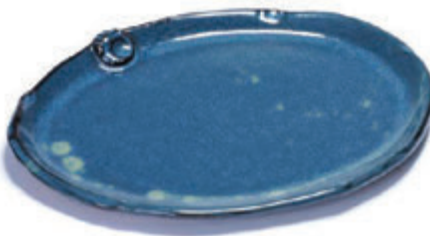
OVAL SIDE PLATE ES7 | $45