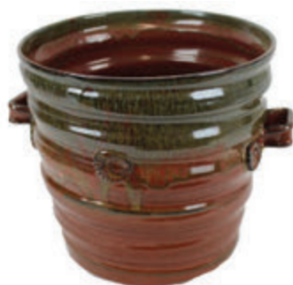
WINE CROCK SMALL