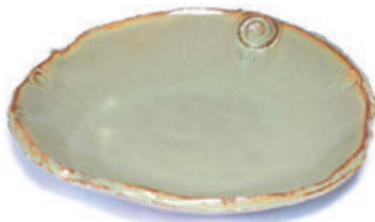
ROUND FOOTLESS PLATE