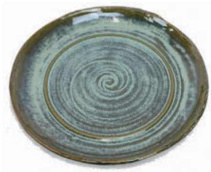
THIN PLATE EDT | $60

Approx: 1.5" x 8" x 4". Shown in Sierra.