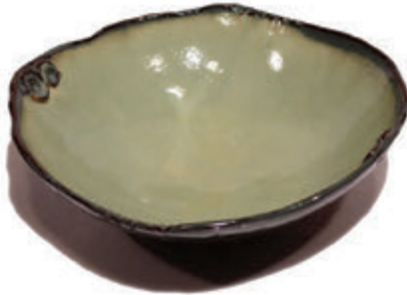
PARTY BOWL SB5 | $125

Approx: 5" x 17" x 12". Shown in Paradise Blue.