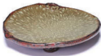
ROUND FOOTED SALAD APP

Freeform round and footed. Approx: 1.5" x 10". Shown in Sky.