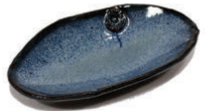
OVAL SIDE DISH ESD3 | $38

Approx: 1" x 8" x 4". Shown in Sapphire.