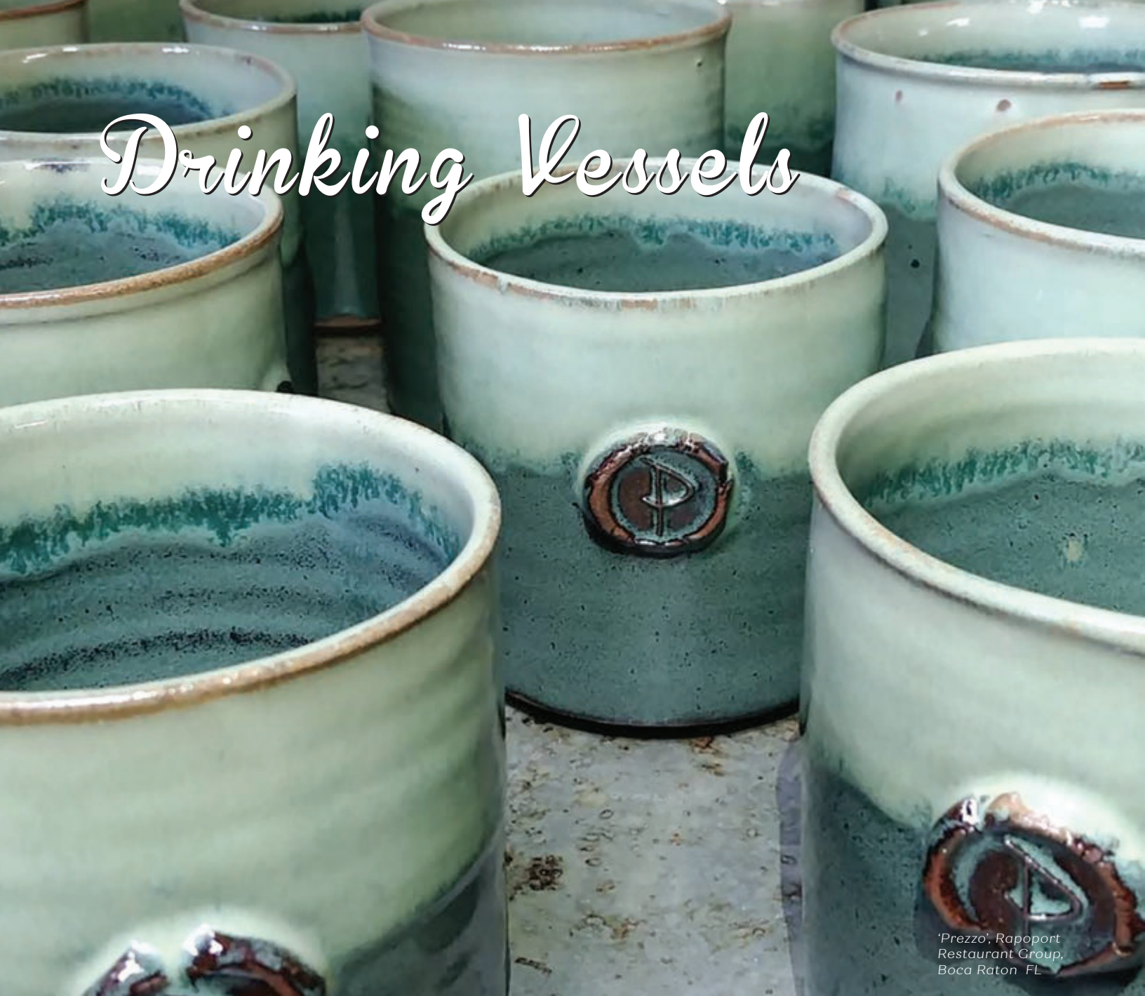
'Prezzo', Rapoport Restaurant Group, Boca Raton FL