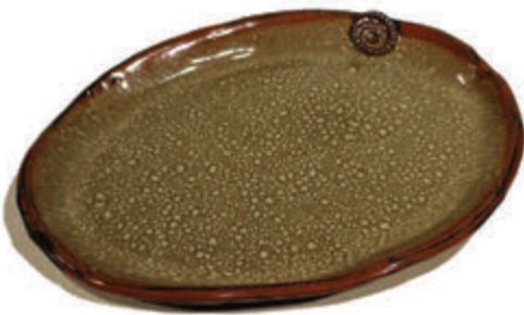
OVAL PLATE ED7 | $60

Approx: 1.5" x 6" x 5". Shown in Paradise Blue.