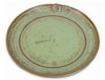
THIN SALAD APP EST | $45