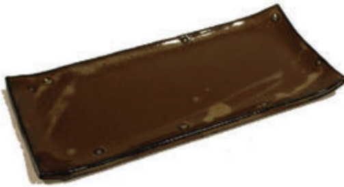
5X12 SHARE PLATE

Approx: 6" x 11". Shown in Vanilla Bean.