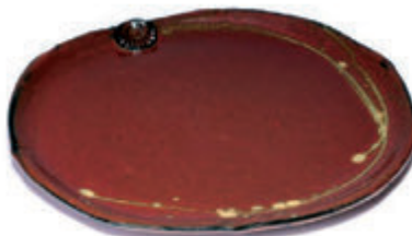
PIZZA PLATE SP11 | $80

Real fish impression. Great as a server or just display it on a stand. Approx: 1" x 20" x 9". Shown in River Rock. Not suitable in all glaze colors. Ask for details.