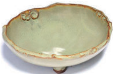
BASIC BOWL EBF3 | $55