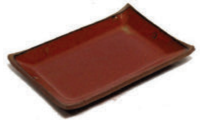
5X8 SHARE PLATE

Approx: 5" x 12". Shown in Forest Brown.