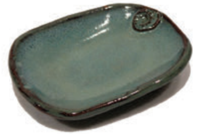
RECTANGLE SIDE DISH ESD4 | $38

Approx: 1" x 9" x 4". Shown in Mountain Mist.