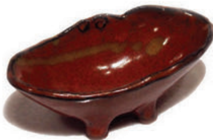
OVAL NOODLE BOWL