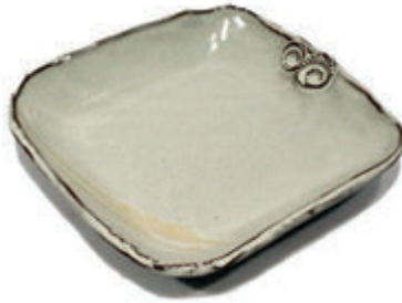
MEDIUM SQUARE BOWL

Approx: 1.5" x 6.5" x 6.5". Shown in Waterfall.