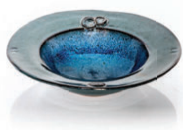
WIDE-RIM BOWL EWRB | $50

Used by Hot & Hot Fish Club. Approx: 3" x 10". Shown in Vanilla Bean.