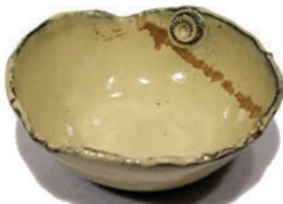
FOOTLESS PORRIDGE BOWL EBFL2 | $50