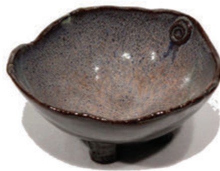
FOOTED PORRIDGE BOWL EBF2 | $50

Great for soups, salads, and cereal. Approx: 3.5" x 8". Shown in Mountain Mist.