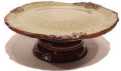
MEDIUM CAKE PLATE ECP2 | $135