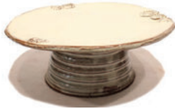
SMALL CAKE PLATE ECP1 | $75

Use as a cake plate or chip & dip. Approx: 3" x 10". Shown in Hazel.