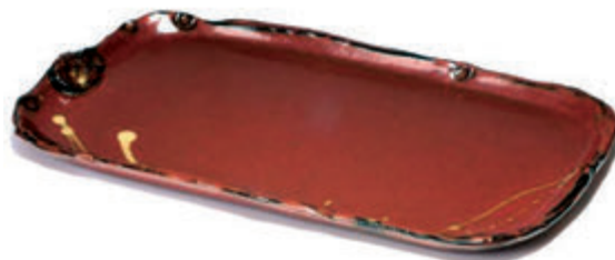
EXTRA-LARGE RECTANGLE PLATTER ERP-XL | $275