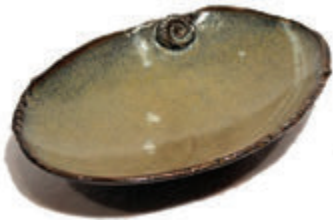
SMALL OVAL SERVING BOWL EOSB1 | $120

Approx: 3" x 14" x 10". Shown in Gold Dust.