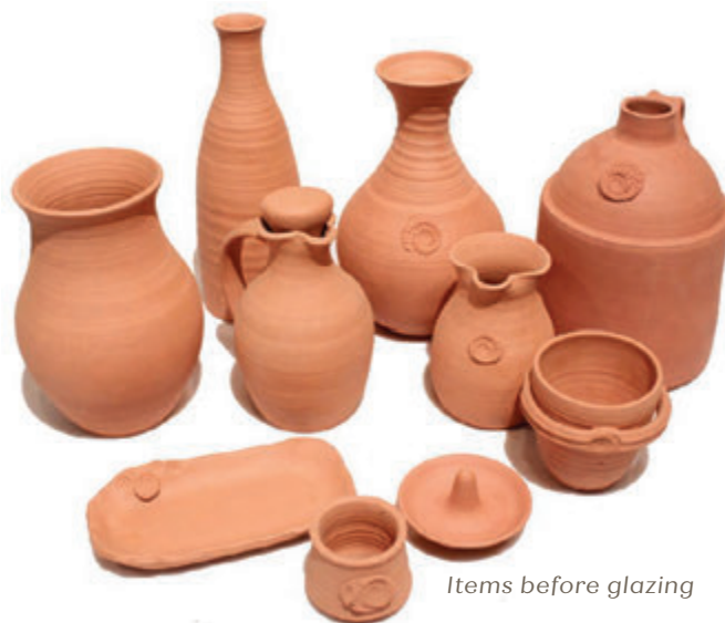
Items before glazing

Don't see what you want? No worries, we can make it. Sink basins, lamps and custom tiles are some of our other projects. Contact us for help with your unique project.