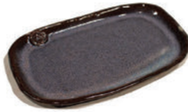
RECTANGLE SIDE PLATE ES6 | $45

Approx: 1" x 9" x 4". Shown in Mountain Mist.