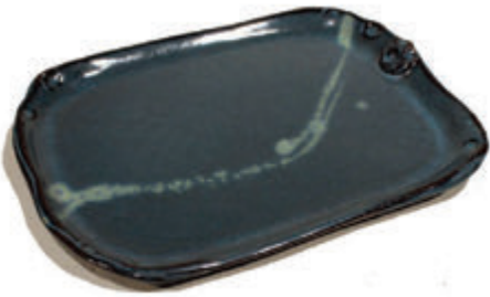
RECTANGLE PLATE ED6 | $60