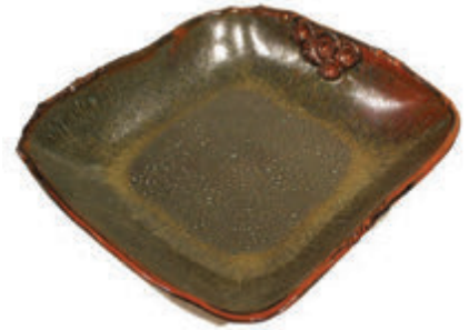
LARGE SQUARE BOWL

Approx: 2.5" x 9.5" x 9.5". Shown in Vanilla Bean.