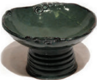
MEDIUM PEDESTAL BOWL EPB4 | $100

Approx: 8" x 10". Shown in Calypso Blue.