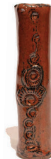
LARGE FREEFORM VASE