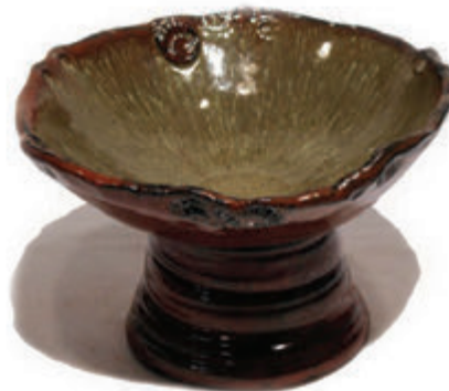
LARGE PEDESTAL BOWL EPB6 | $175

Approx: 8" x 10". Shown in Calypso Blue.