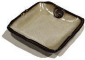
SMALL SQUARE BOWL