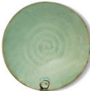
8" THROWN SIDE PLATE