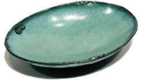
LARGE OVAL SERVING BOWL EOSB3 | $250

Approx: 4" x 15" x 11". Shown in Forest Brown.