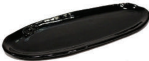
BREAD SERVER EPBS | $100

Approx: 1" x 15" x 12". Shown in Calypso Blue.