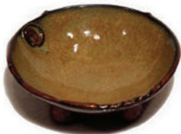
HALF-PORRIDGE BOWL EBF2.5 | $38