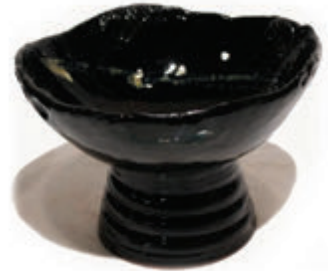
SMALL PEDESTAL BOWL EPB2 | $75