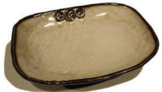
LARGE RECTANGLE BOWL ERB3 | $135

Approx: 4" x 14" x 11". Shown in Waterfall.