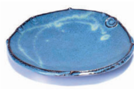
ROUND FOOTED PLATE