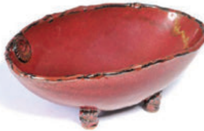
DEEP OVAL SERVING BOWL EDOSB | $125