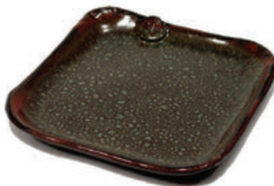
SQUARE SIDE PLATE

Approx: 1" x 10" x 10". Shown in Paradise Blue.