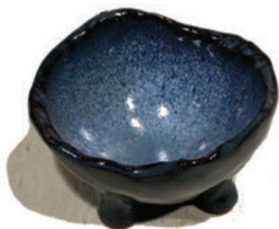
ROUND NOODLE BOWL