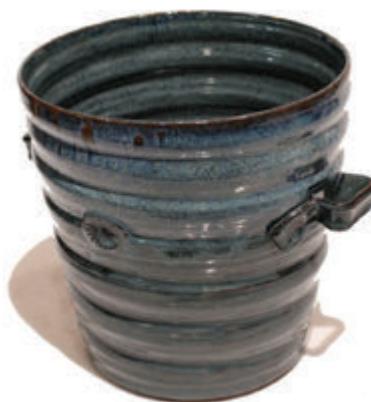
WINE CROCK LARGE