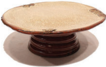
LARGE CAKE PLATE ECP3 | $150