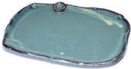
RECTANGLE CHARGER ECGR | $130

Approx: 1" x 15" x 12". Shown in Calypso Blue.