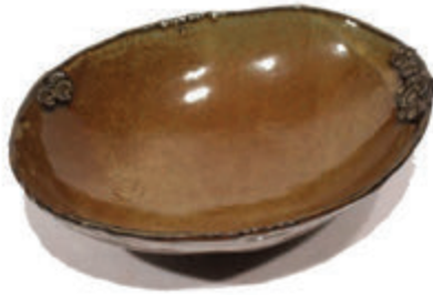
MEDIUM OVAL SERVING BOWL EOSB2 | $185

Approx: 3" x 14" x 10". Shown in Gold Dust.