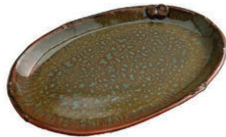
OVAL SERVING DISH OSD | $65

Use it as a platter, serving dish or a dinner plate. Approx: 1" x 13.5" x 8". Shown in Peacock.