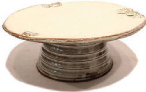
EXTRA-LARGE CAKE PLATE ECP4 | $225