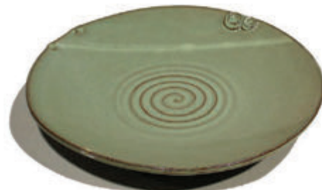
11.5" THROWN PLATE