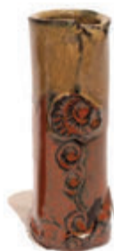
SMALL FREEFORM VASE